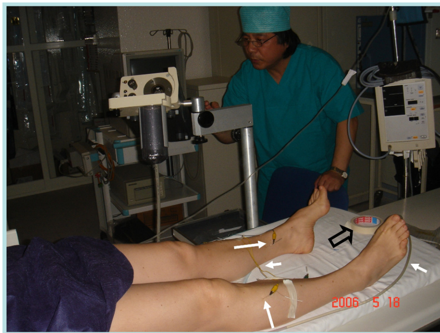
Figure 2. Needles at anesthesia points (large white arrows) connected through wires (small white arrows) to an electrostimulator (open arrow). (Available in color online at www.jvir.org .)

No local subcutaneous anesthesia was used in patients in group A.